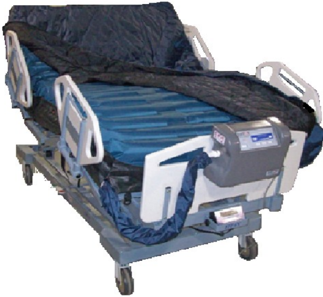
(Pictured on the TITAN1000 Bariatric Frame)